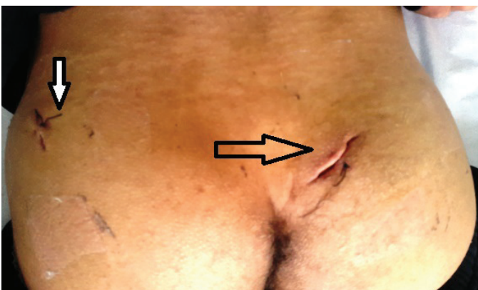
Figure 3. Postoperative gluteal injury sites

approximately 200 cc hemorrhagic fluid was present in the abdomen. It was observed that approximately 15 cm incarcerated small intestinal loop, 20 cm proximal to the ileocaecal valve, had slipped out through the penetrated obturator canal during the injury. The incarcerated intestinal loop was taken back into the abdominal cavity, and three perforated areas and necrosis were observed (Figure 2). The injured segment was resected and end-to-end anastomosis was performed.