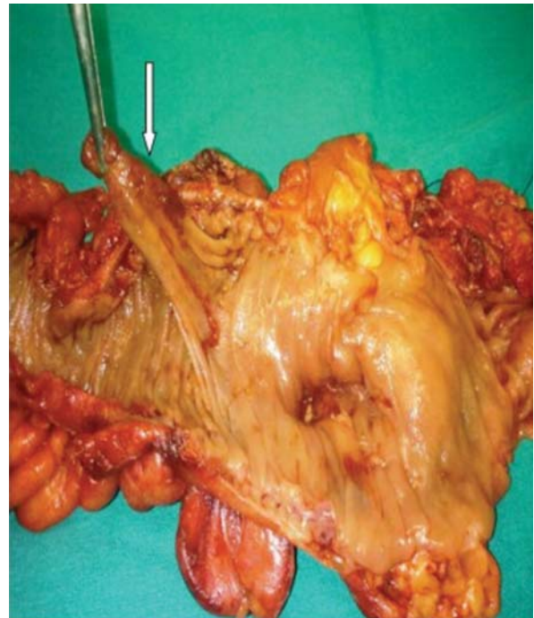
Figure 6. Pediculated tubular adenoma.

Perforation of colon has been one of the imminent complications of routine or therapeutic colonoscopy. Although colonoscopic perforation might occurs rarely, it can be associated with high mortality and morbidity. In our center incidence of colonoscopic perforation rate was 0.051%. The incidence of perforation in the high-