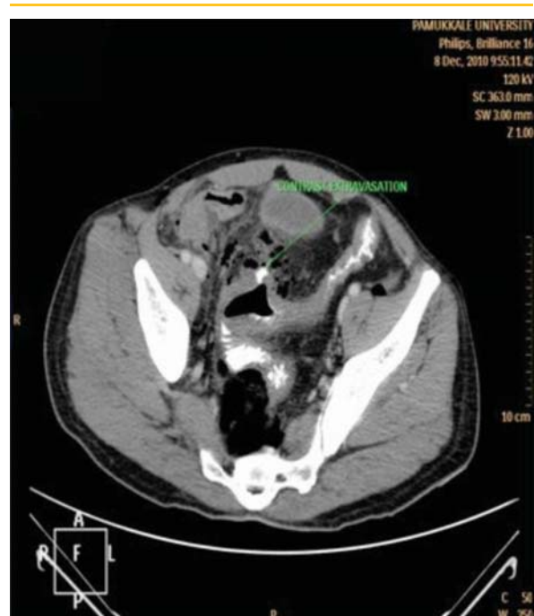
Figure 3. CT demonstrate late perforation.

Laparotomy revealed that the perforation site was at the rectosigmoid junction (Fig. 4). Since rectovesical fossa filled with pus, Hartmann surgery preferred due to the