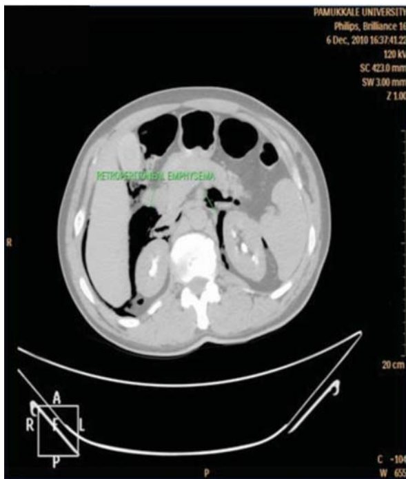
Figure 1. CT demonstrate retroperitoneal free air.

Physical examination revealed emphysema in the neck and chest, patient's voice was changed, his face was swollen and had abdominal distention and discomfort without tenderness and signs of peritonitis. White blood cell (WBC) count was 7000/ml. Upright plain abdominal and chest X-ray films were normal. Contrast computed tomography (CT) (with both oral and rectal routes) examination revealed large amount of air in the retroperitoneal space but no signs of peritoneal perforation and substantial retroperitoneal perforation (Fig.1).