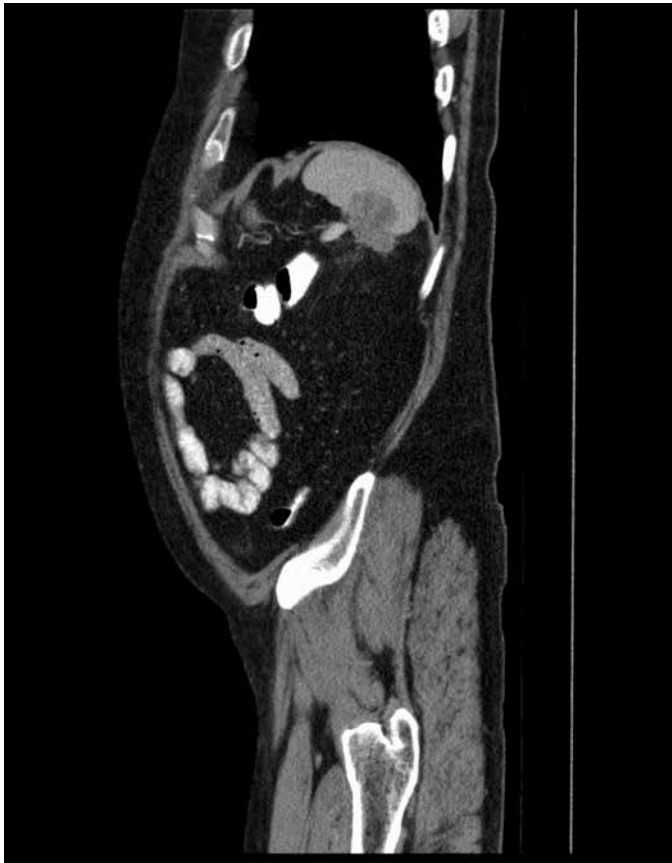
Figure 1. Computerized tomography imaging before splenectomy