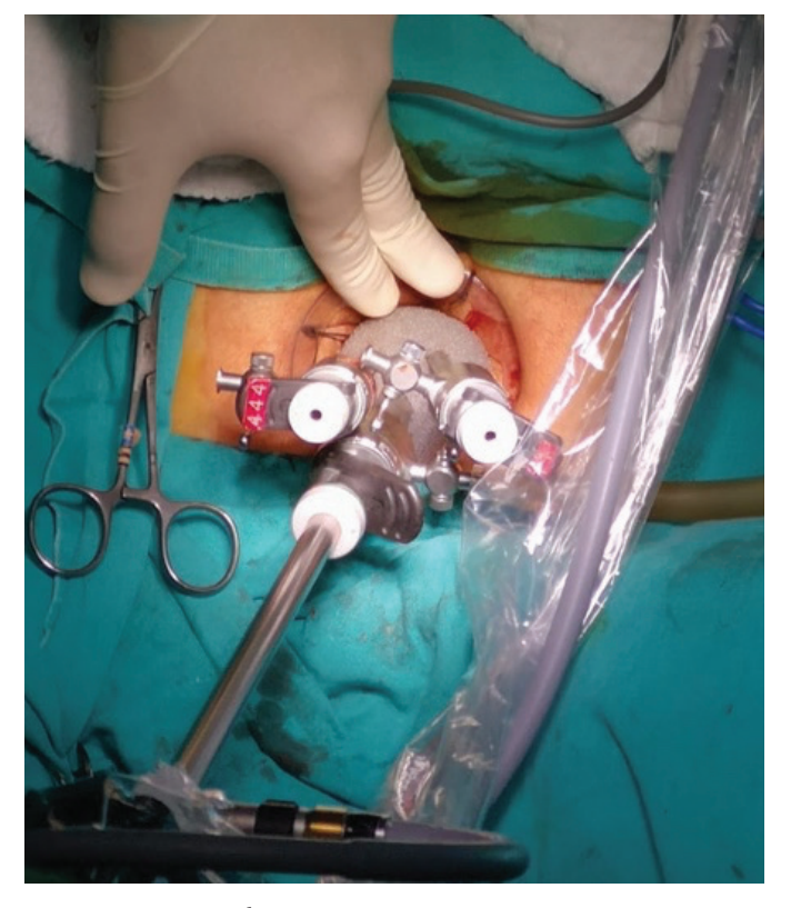
Figure 2. Sponge single-port