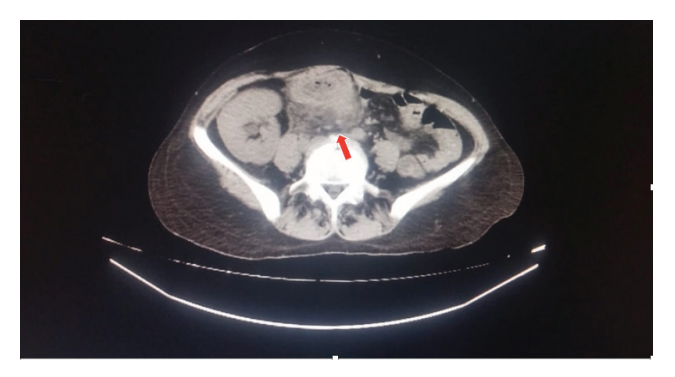
Figure 1. An inflamed bowel segment formed a mass of 2x3 cm in size which mimicked a plastrone secondary to acute appendicitis